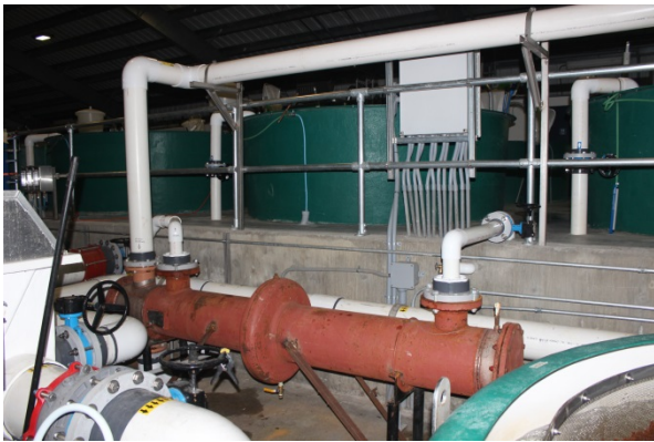
Figure 3. Heat exchanger used for cooling.