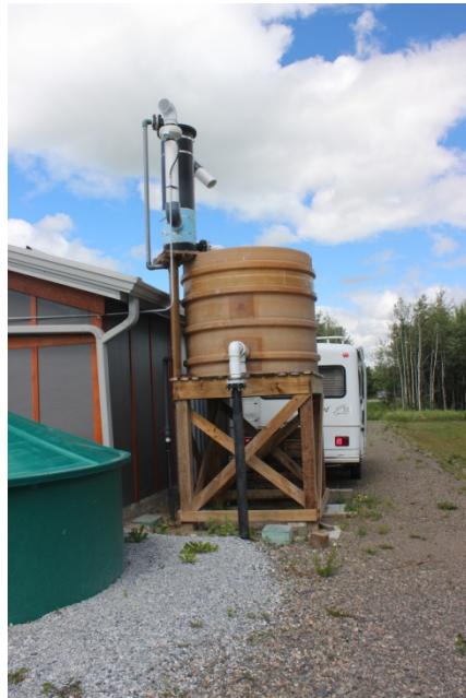
Figure 4. Municipal water aeration tower.