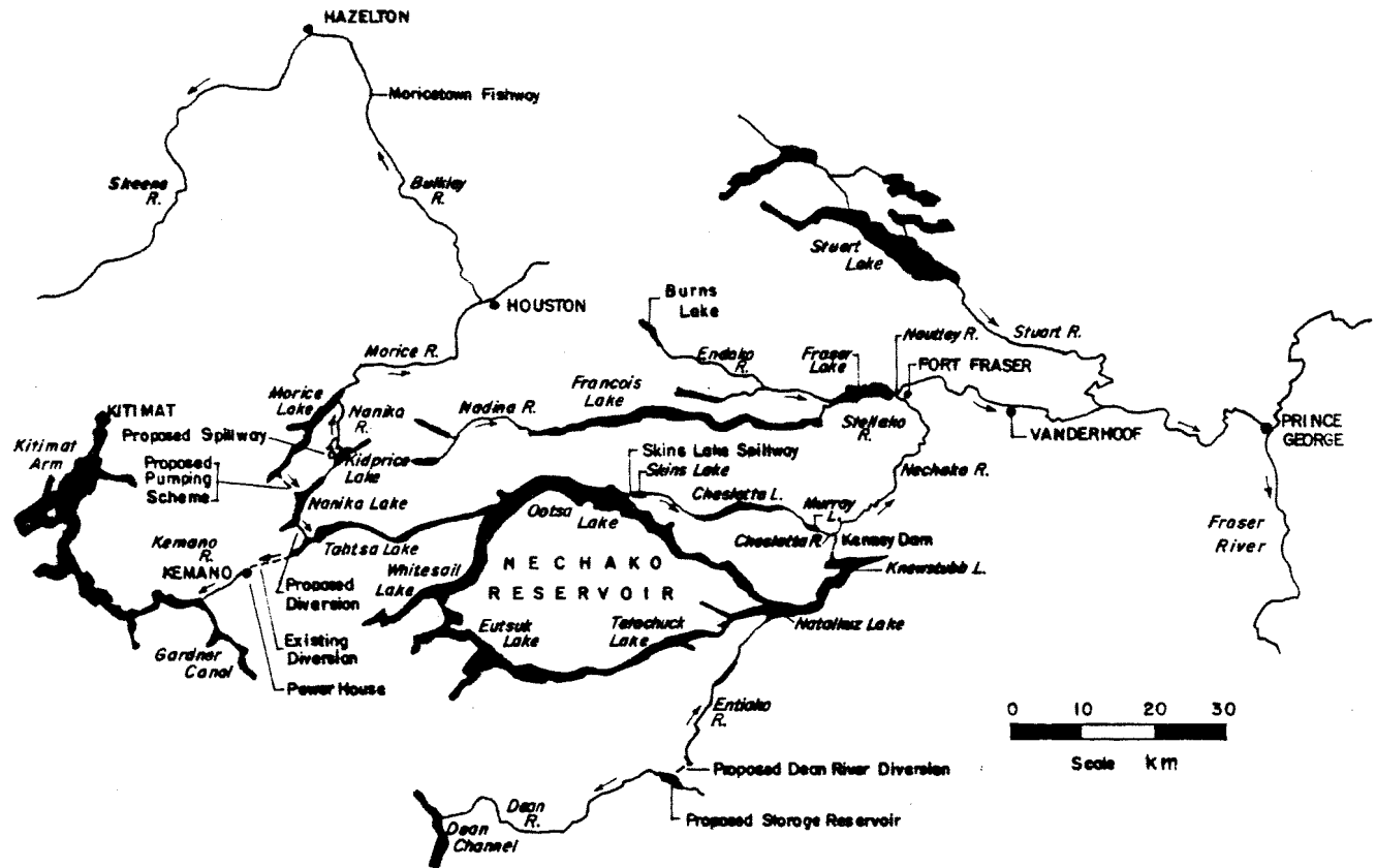
FIGURE 2 : The Nechako River Reservoir (after building of the Kenney Dam)