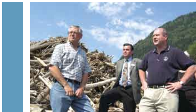
Collaborative governance is a proven model for achieving sustainability, as more people are beginning to realize.

The FBC is asked to lead discussion forums, consultations, workshops, dialogues and planning sessions on sustainability, with participation of the public sector, the private sector and civil society. Success often means bringing people together at the right time, in the right spirit and with the right information to begin a dialogue. This is how ideas take root, grow and blossom into wonderful new partnerships and programs—such as Fraser Valley small lot producers reaching new markets for