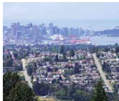
Greater Vancouver would have much to gain from a regional economic strategy that is inspired by sustainability principles.