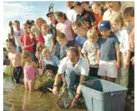
Conservation and recruitment efforts are underway to rebuild the Nechako White Sturgeon population.