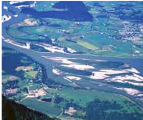
A look down onto the Lower Fraser floodplain. Flood hazard management requires sound research, effective strategies and coordination of efforts.