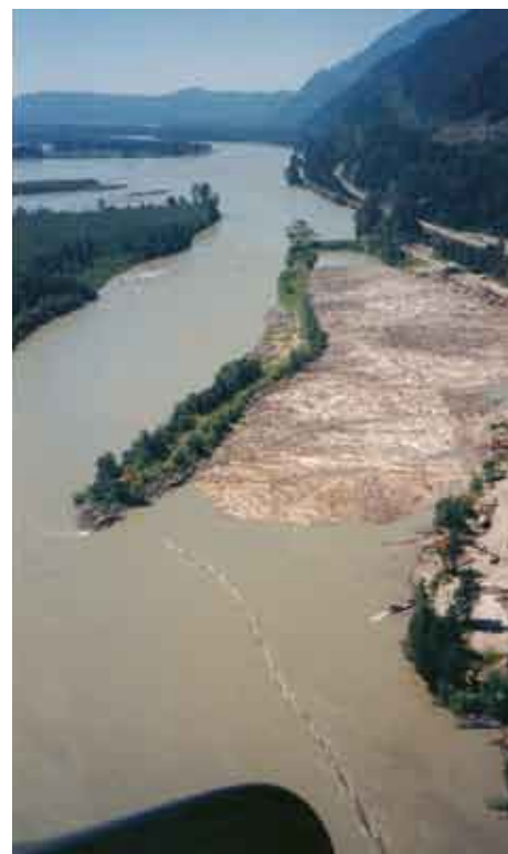
The Fraser River wood debris trap helps keep the Fraser safe for navigation.