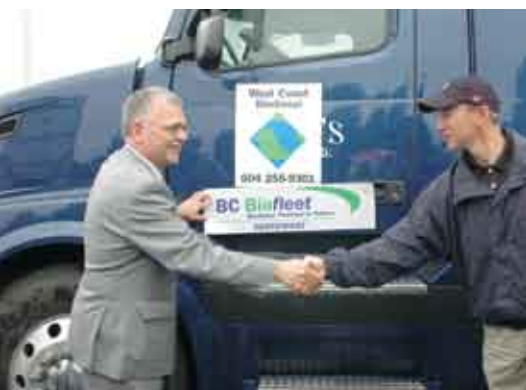
BC Biofleet was one of several programs launched by the FBC.

For details on these projects, see "Across the Basin" in the pages that follow.