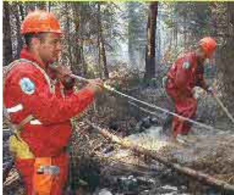
Interface fire plans are fast becoming a priority—and FBC was pleased to help facilitate planning in Williams Lake and Quesnel.