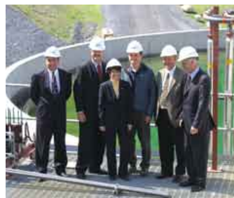
Celebrating a new water treatment plant at Britannia Mines in 2006. Years earlier, it was the FBC that called on the parties to negotiate a clean-up of this seriously contaminated site.