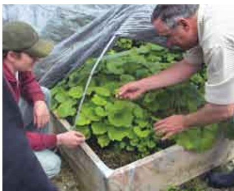
Sustainability partnerships at work—Fraser Valley small lot producers reach new markets.