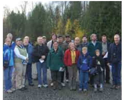
The Chilliwack River Watershed Plan project team are helping to build a common understanding of watershed values.