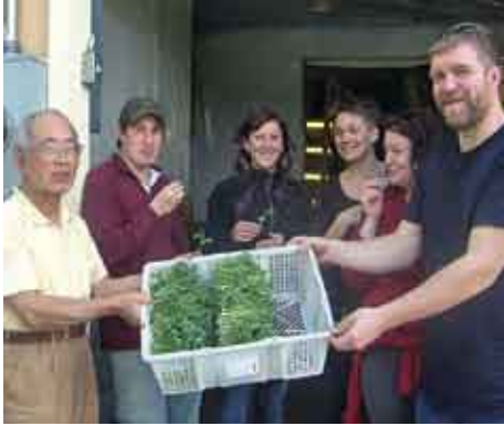
Strengthening agriculture and boosting opportunities for small business—two ways to build strong communities.