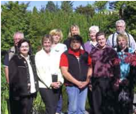
Members of the BC Rural Network—building awareness of rural issues.

Economic diversity and resilience are critical to the sustainability of communities. Yet in many rural areas of the Fraser Basin, people remain dependent on the fortunes of single natural resource sectors, such as forestry, mining, or fisheries. Through its Strengthening Communities program, the Fraser Basin Council works with communities to meet local social and economic needs over the long term.