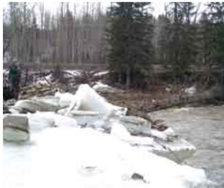
After ice jams and flooding at Naver Creek, attention turned to future flood mitigation and stream bank restoration.