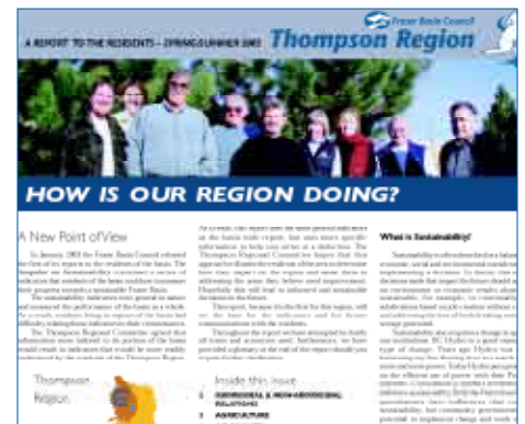
FBC distributed the Thompson Region Indicator Report to 100,000 residents. The report highlights some of the top sustainability issues that impact people every day.